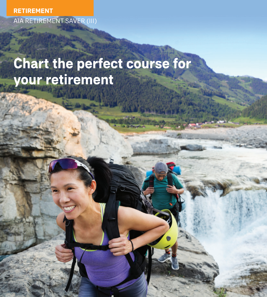
Chart the perfect course for your retirement

Take charge with AIA Retirement Saver (III) today and discover endless possibilities for a retirement worth dreaming about.