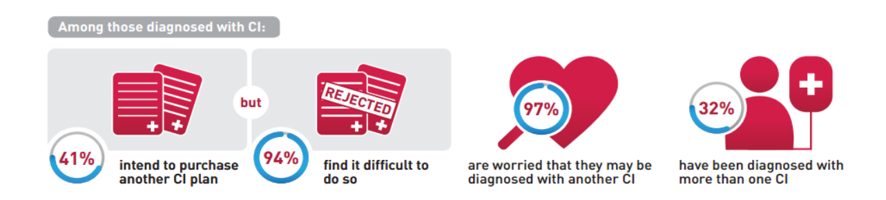
Gap #1: Singaporeans are concerned about not having protection should another critical illness strike

"The majority of patients are financially unprepared for cancer treatment and are shocked that modern chemotherapy and targeted therapy can cost so much.